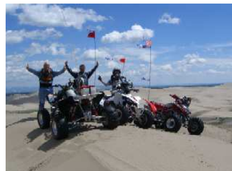
ATV Riders on the dunes at St. Anthony