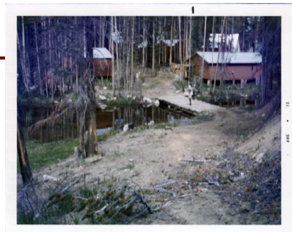
Wilderness in the proposed Boulder-White Clouds "Wilderness" Area.— August 1973

The picture to the right was taken in August 1973 in an area now proposed as part of the Boulder-White Clouds Wilderness. This was a mining exploration camp on Baker Lake at the foot of Castle Peak. The camp was set up by ASARCO mining company. The mining camp is gone now, but the bridge and bulldozed road remain. You can read how this came about at http://www.wildwhiteclouds.org/news_mining_castlepeak.html . My question is how this fits in the wilderness concept... The area is definitely 'trammelled' by man yet is included in the "wilderness" designation (untrammelled by man). I also recall a cabin downstream from Willow Lake. Ron Stricklin