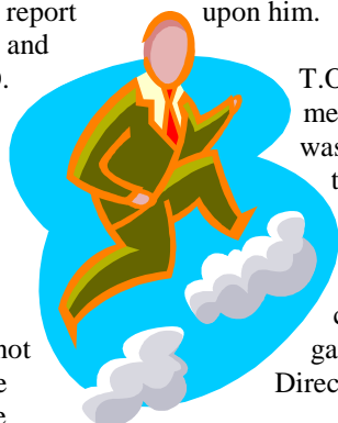
The Other Guy leaving town.

It is with great sadness that we report the death of a Charter Member and long-time willing worker. T. O. (THE OTHER ) GUY, known to all of us as "Old T.O." passed away quietly in his sleep last week. During his long involvement with our organization he has served in every office and chaired every committee. Cause of death is not know but it is suspected that he succumbed to the weight of the responsibilities that were heaped