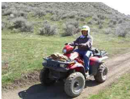
ATV Rider on the Danskin Trails near Boise